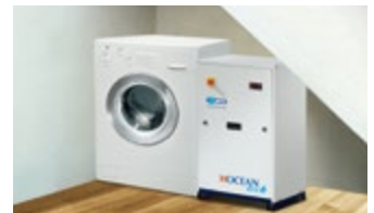
Allows installation in even the most limited spaces.