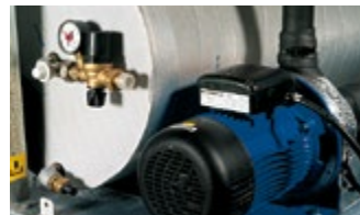
Separate storage and pump module with two pump versions.