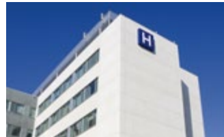
Ideal for air conditioning of civil, public and private buildings.