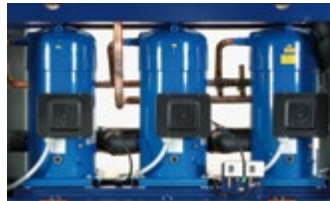
Optimised performance thanks to multiscroll logic.